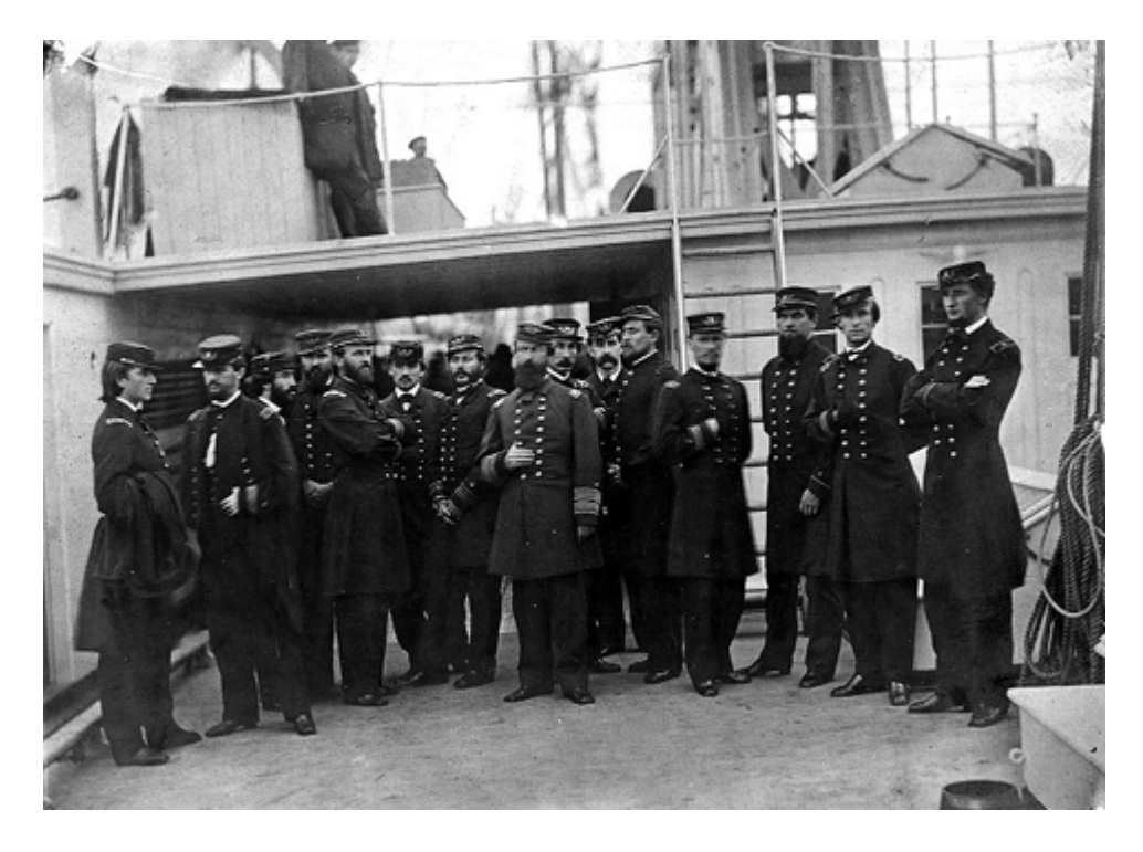
Rear Admiral David Dixon Porter, USN, Commanding, North Atlantic Blockading Squadron. (Center)

what was to be nearly three more decades of commercial employment. On 20 February 1895 the old steamship was wrecked during a storm off the Cuban coast.